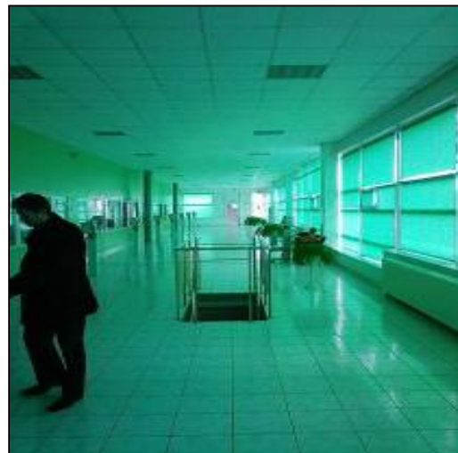
Water Treatment Plant in Krakov (Poland)