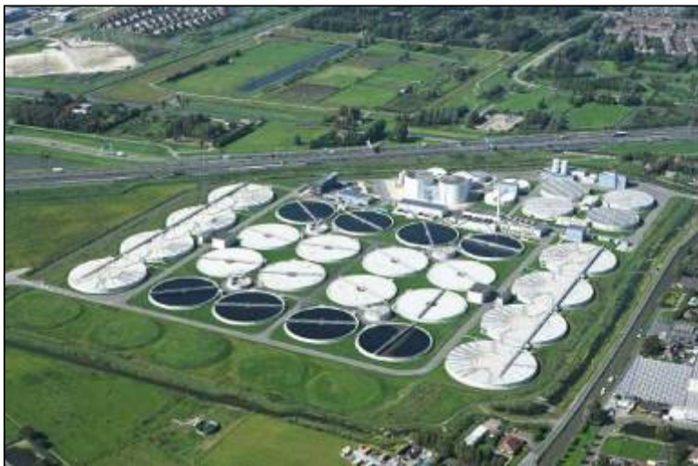
Delfland Waste Water Treatment Plant (NL)