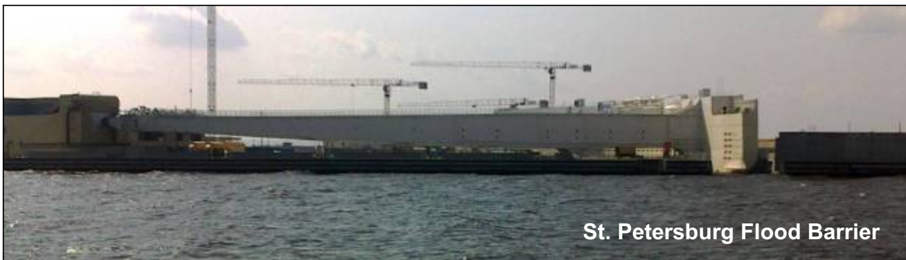
St. Petersburg Flood Barrier